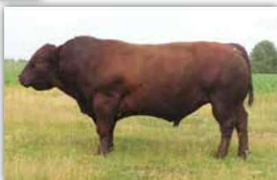
Saskvalley Youngblood 93Y