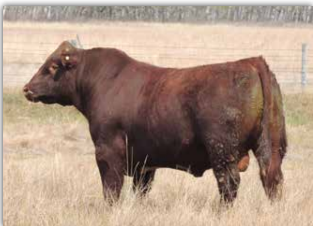
WAUKARU ROCK SOLID 9048