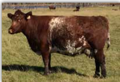
Saskvalley Sindy 2X