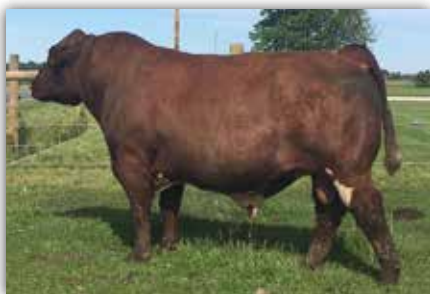
Saskvalley Imperative 33X