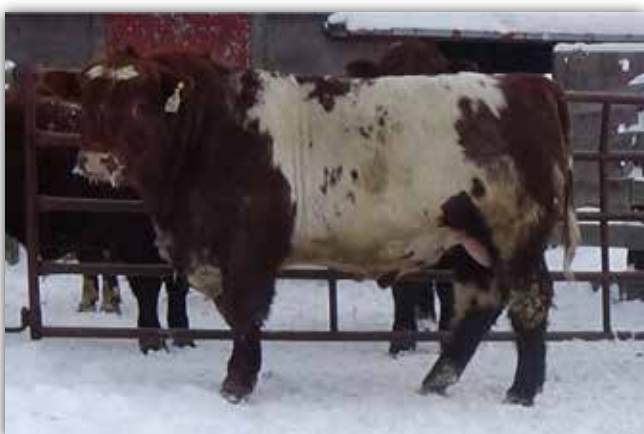
SASKVALLEY EIGHTEEN WHEELER 94E