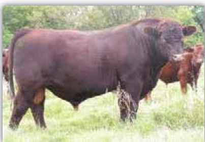
Saskvalley Imagine 65X