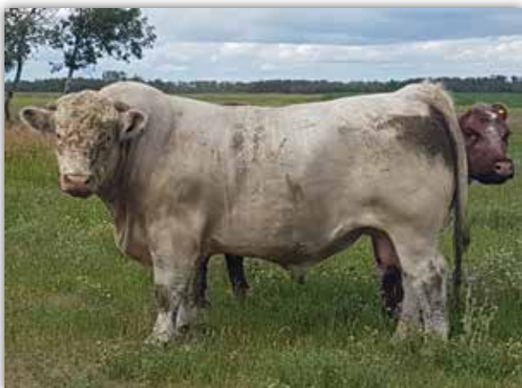
ACC DELTON 26D