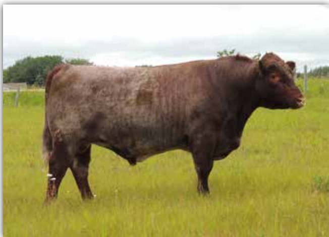
BELL M CAPTAIN 139D