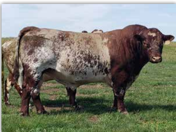
SHANNON'S TODAYS HEADLINE 89C