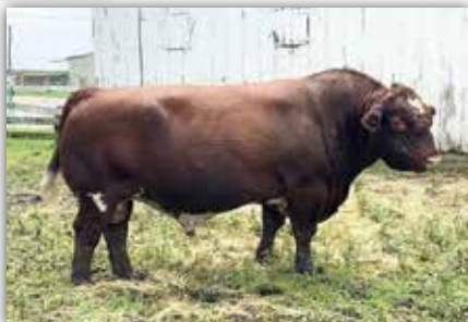
Saskvalley Imperative 33X (pictured at 11 years old)