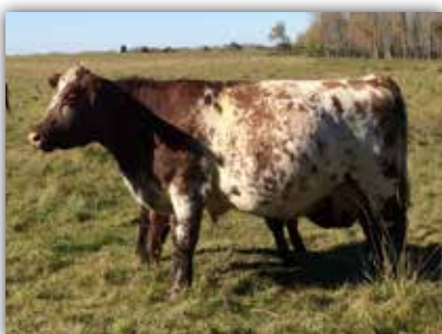
Saskvalley Sindy 62Z