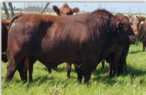
SASKVALLEY DISTINCTION 195D