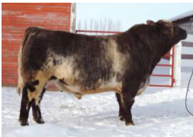
BELL M DETAIL 130A