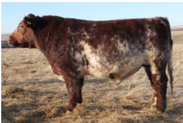
MURIDALE IRON MAN 4X