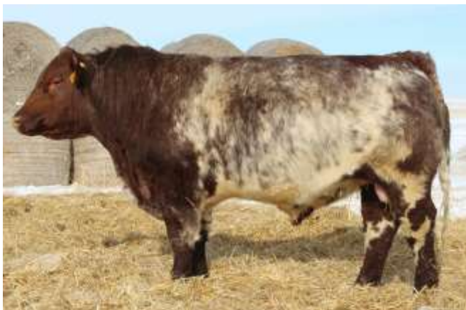
MURIDALE DIMENSION 3D