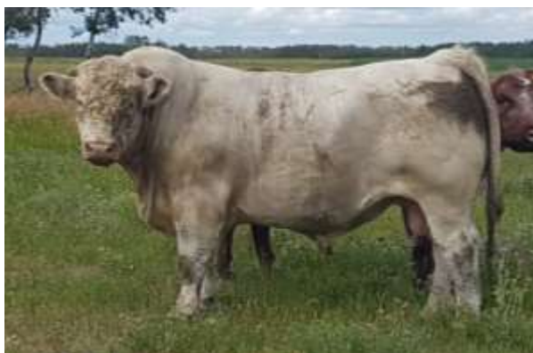
ACC DELTON 26D