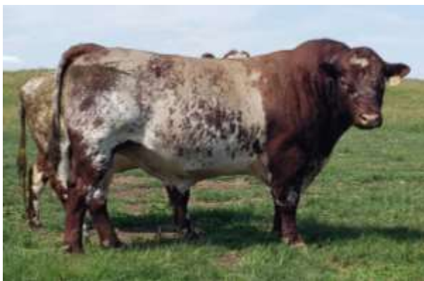
SHANNON'S TODAYS HEADLINE 89C