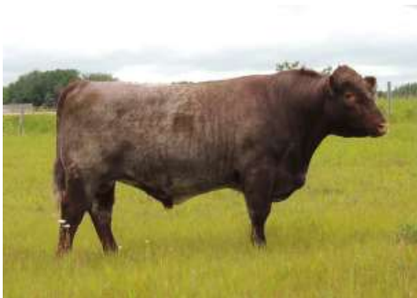
BELL M CAPTAIN 139D