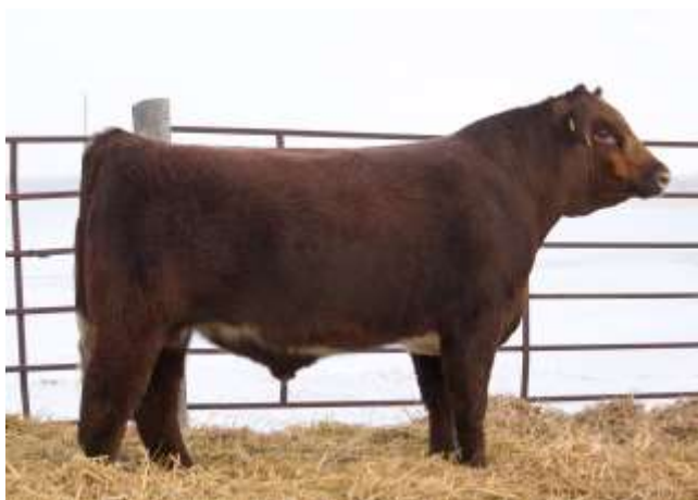
JSF WALL STREET 70E